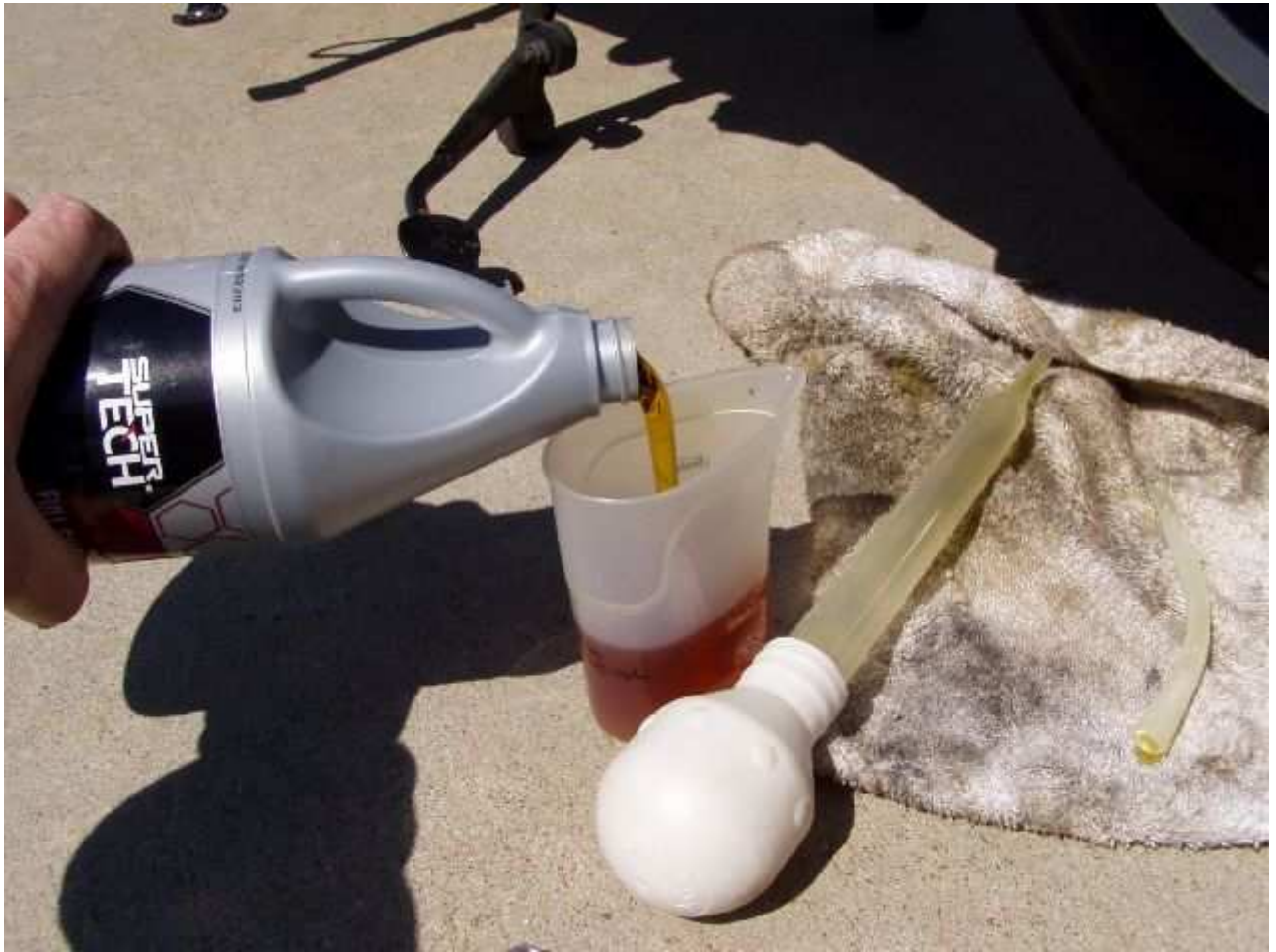
After I figured out how much old oil drained out, I filled a clean container with the same amount of synthetic 90 weight gear oil.